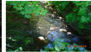
Fly tipping Shady Lane Brook